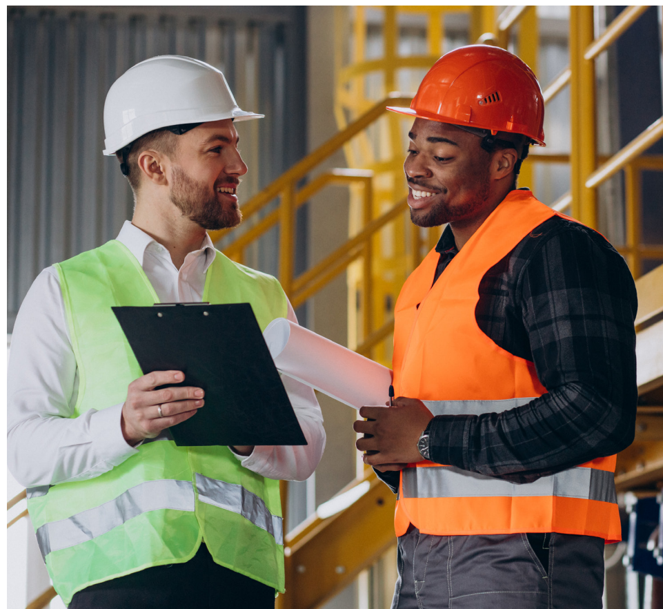
Factory worker photo created by senivpetro - www.freepik.com

The rising cost of construction is another big problem for construction firms in 2022. Even with the right number of workers and the funding for supplies, supply shortages affect ev-